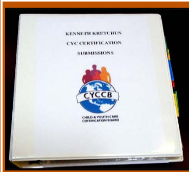
Ken's Application Binder